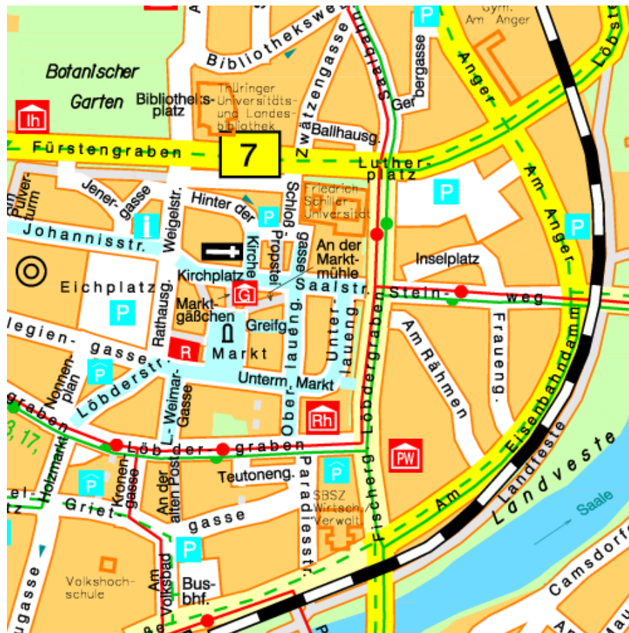
Figure 2: Jena, inner city center